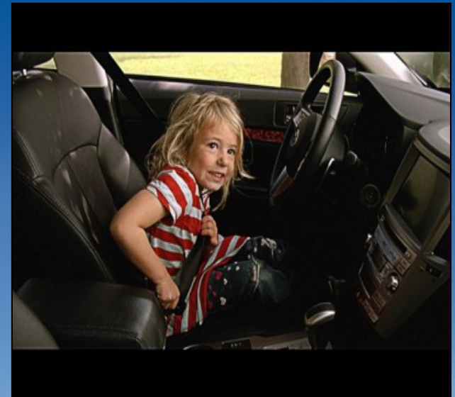
2010 Subaru Commercial