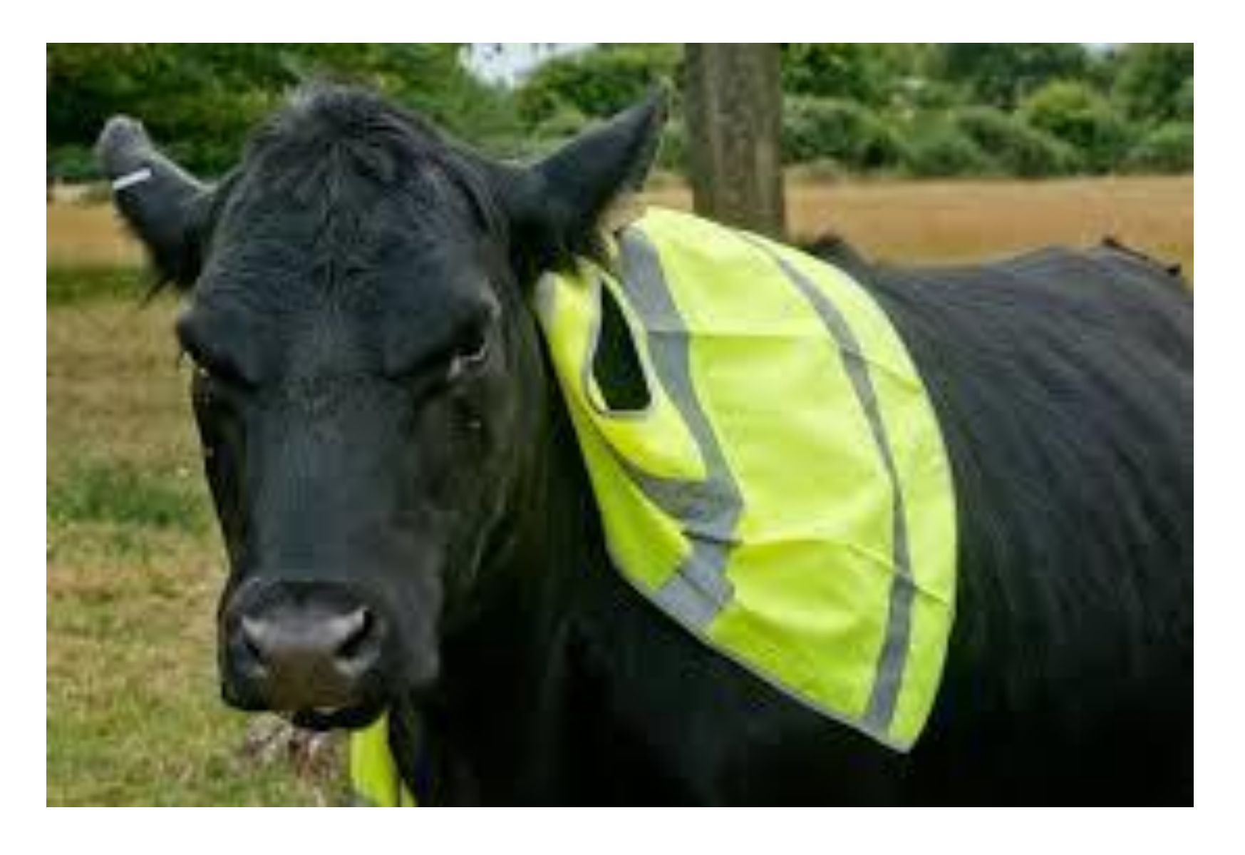
Don't forget the high visibility vests and traffic barricades or cones!